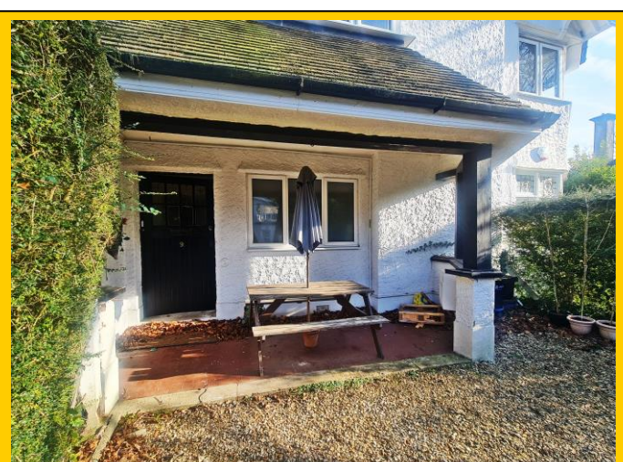
St Anthony's Road, Meyrick Park, Bournemouth, BH2 6PB